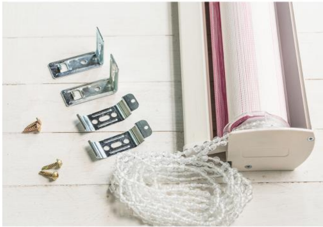
1. Package Contents