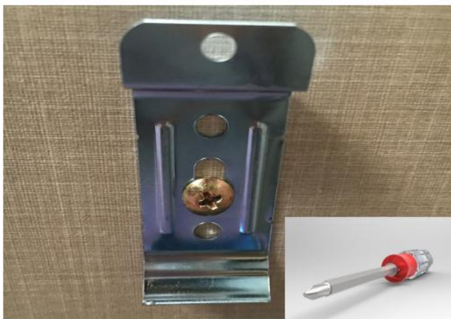
3. Secure the piece with a screwdriver