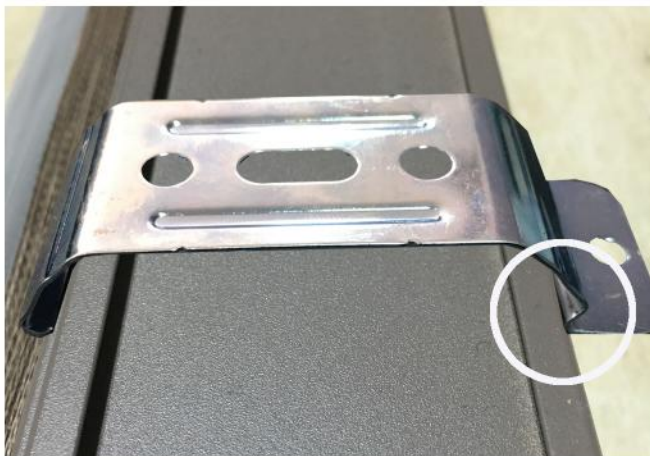
5. Snap hooks fixed to the front of the body