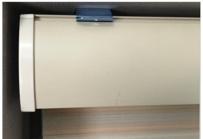
6. Product Installation Complete