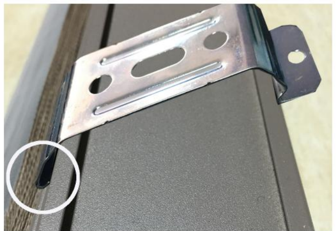
4. Snap hook fixed to the back of the main body