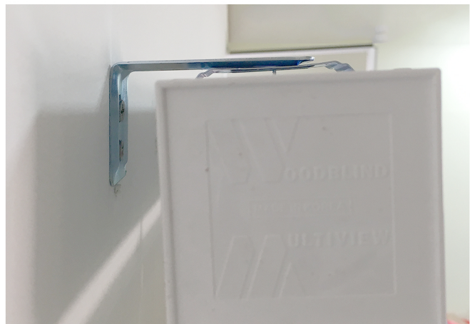
6. Product Installation Complete