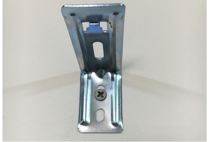
2. Bent parts fixed to the wall