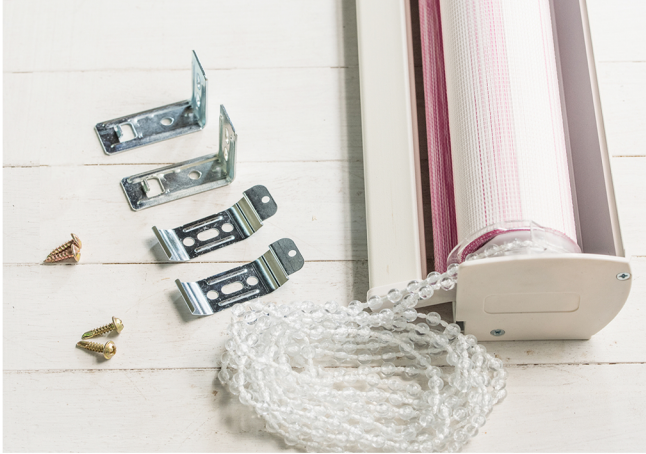
1. Package Contents