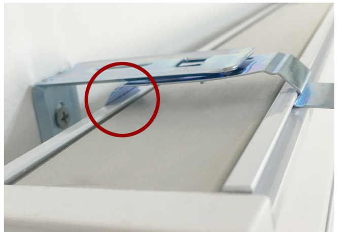
4. Snap hook fixed to the back of the main body